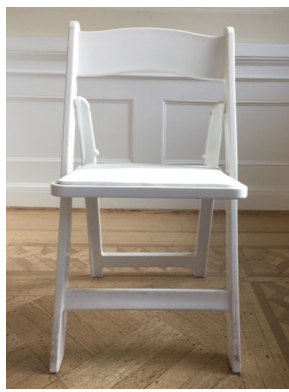
(200) White folding resin chair (outdoor only)