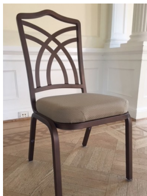
(140) Banquet chair (indoor only)