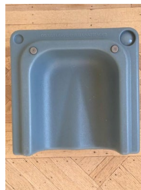
(3) Booster seat