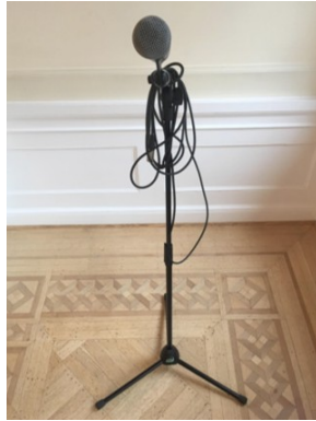
(1) Wired microphone