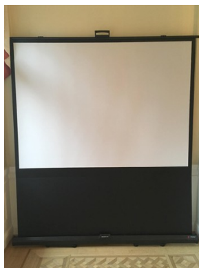
(1) Projector screen $100