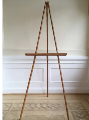
(2) 5.4' x 2' Wooden easel