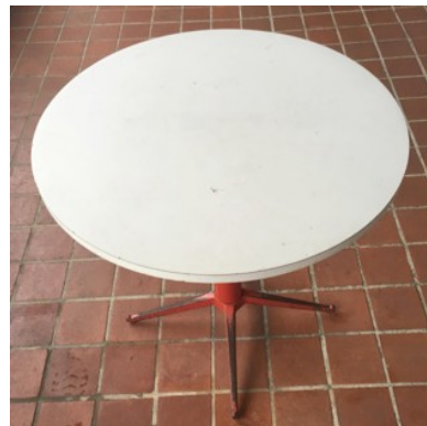
(3) 30" round x 30" low cake table