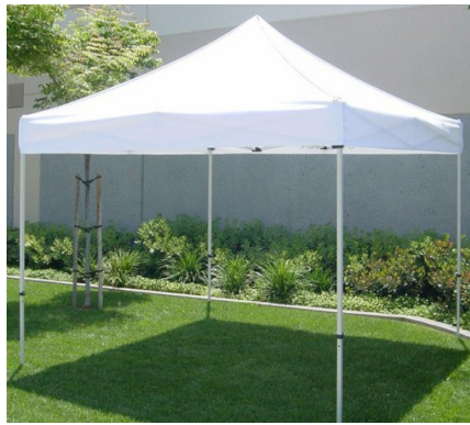
(1) 10' x 10' white pop up tent