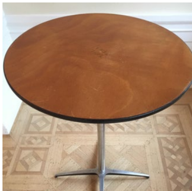
(8) 30" round x 42" high cocktail table