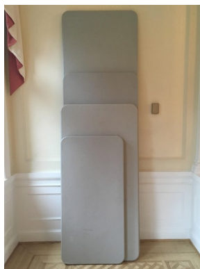
(5) 4' x 2' table