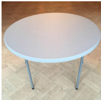
(20) 48" round x 30" high table