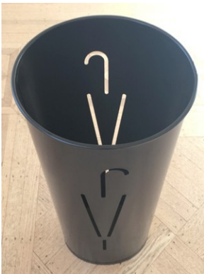
(2) Umbrella stands