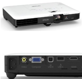
(1) Epson Projector $100